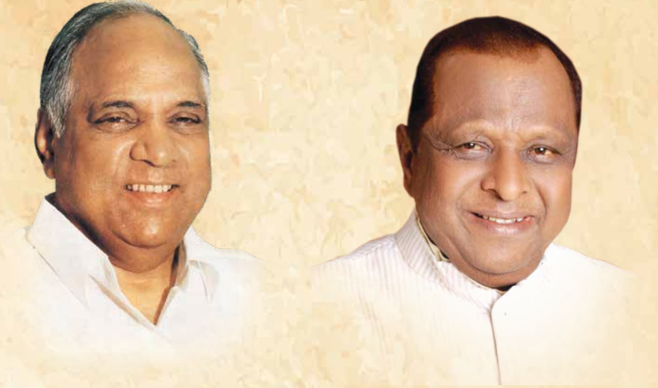
आदरणीय मा. शरदचंद्रजी पवार साहेब मा. कृषी मंत्री, भारत सरकार

महाराष्ट्राच्या ग्रामीण भागात शिक्षणाच्या माध्यमातून महिलांसह समाजविकास करण्यासाठी आयुष्य समर्पित करणारे संस्थेचे संस्थापक